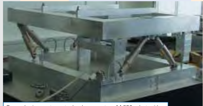
Beyond microsystems technology: custom M-850 robot with a positioning frame measuring some 1.0 x 1.5 meters.