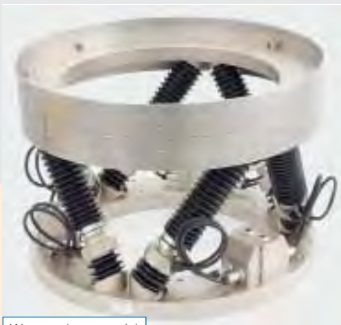
Water resistant model of the M-850 with extra-large positioning frame.

A basic requirement for all advanced fine-adjustment tasks is the ability to rotate about a given point (pivot point, e.g. the tip of an optical fiber or the reference mark on a semiconductor wafer). PivotAnywhere™ allows setting the pivot point anywhere in space with a single software command.