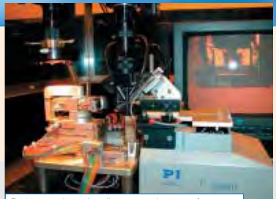
F-206 as a photonics alignment subsystem for automated assembly of fiber pigtailed devices.