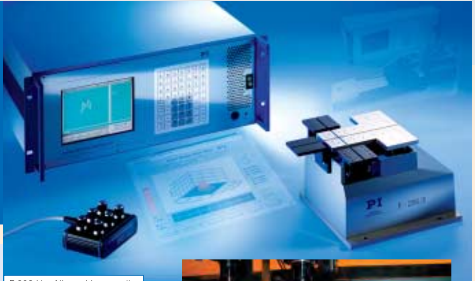
F-206 HexAlign with controller and manual control pad.