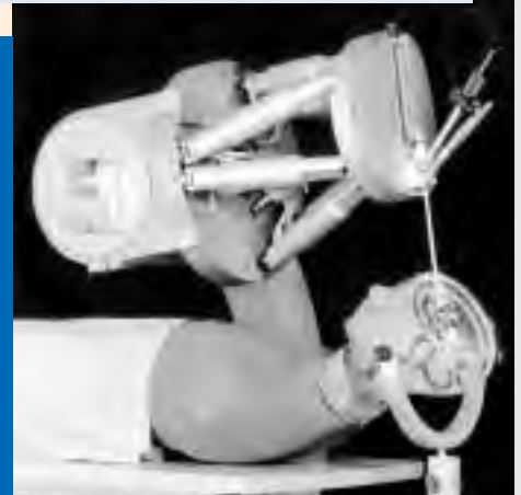
Custom M-850 in operating robot for neurosurgery.