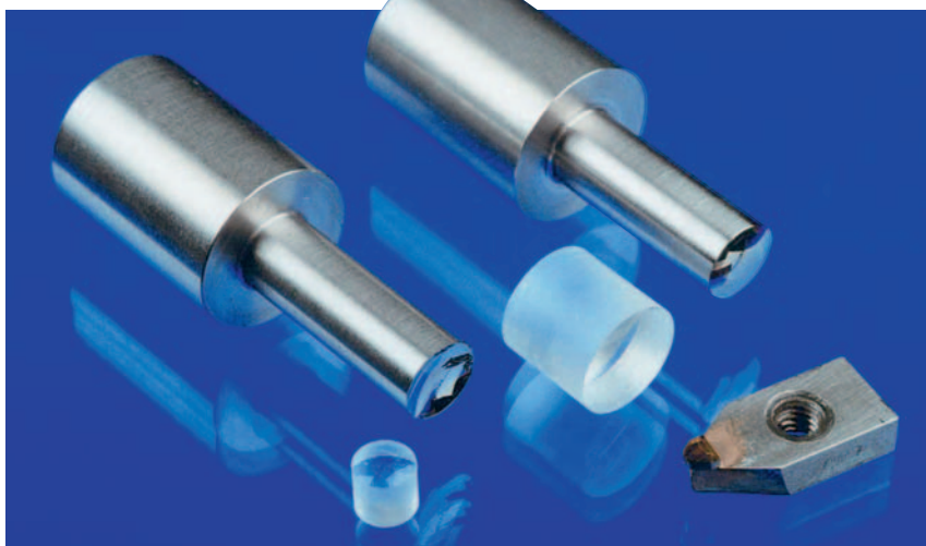
Fig. 1: The tighter the tolerances required for a product, the higher the precision required of the testing equipment. The optical mold inserts for production of plastic or glass lenses have especially high precision requirements. (Illustration: Fraunhofer Institute for Production Technology, IPT)

The integration of testing equipment for optical mold inserts (Fig. 1) directly into the manufacturing cell avoids complex and time-consuming setup steps and completely eliminates rechucking errors. The new testing unit developed by the Fraunhofer Institute for Production Technology (IPT) in Aachen, Germany tests the optical mold inserts directly in-line, on the production machine. Discre-